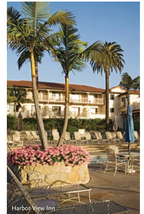
Harbor View Inn

Set on a 10,000-acre working cattle ranch, the Alisal Guest Ranch & Resort offers 73 guest cottages and suites, two 18-hole champion-