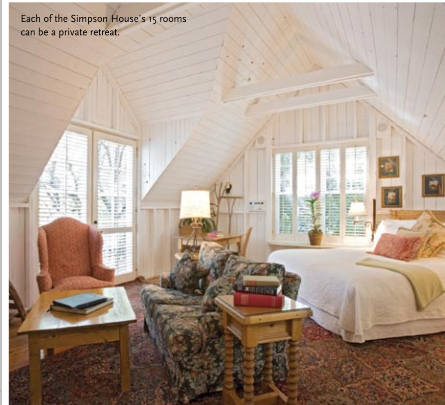
Each of the Simpson House's 15 rooms can be a private retreat.

B uilt as a private home in 1874, The Simpson House Inn is an architectural icon of Santa Barbara, an Italianate Victorian mansion hidden by lush gardens. When it opened its doors in 1985, the 15-room bed-and-breakfast raised the bar for hotels across the state; it's received AAA's Five Diamond rating for 11 years straight.